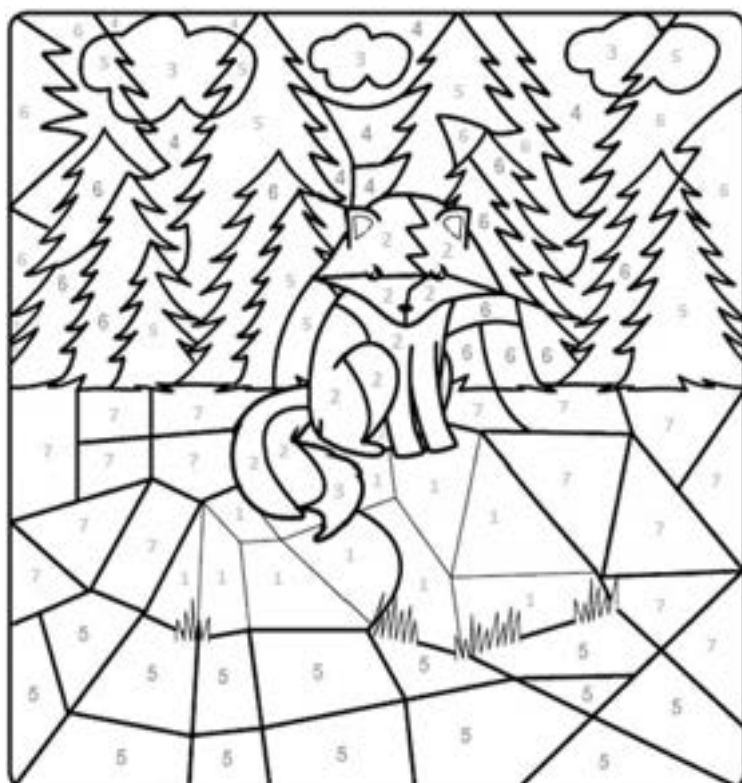
Wukchumni - color by number

This game reinforces the Language as you hear each student repeat the words, phrases and sentences. It is a game the entire class enjoys. Join in on the fun during our in person classes every Thursday from 4-6pm!